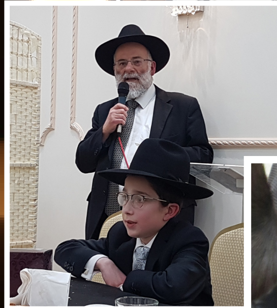
Speaking at his einikal bar mitzvah only weeks before his petirah.